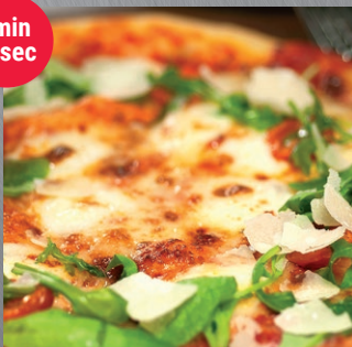
Chilled, pre-baked, thin crust pizza