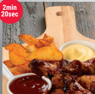
Chicken wings and potato wedges