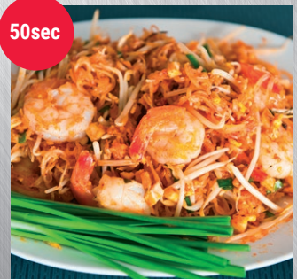
Chinese stir fry